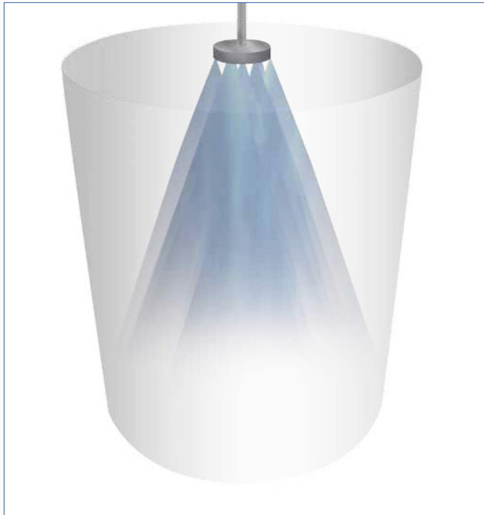
Schematic view of reactor

Please contact Lechler for available flow rates and spray angles.