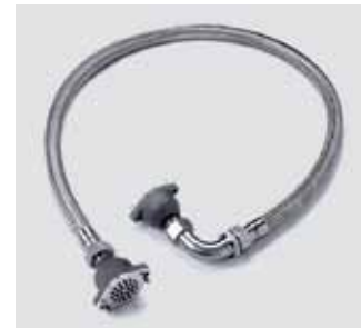
Air and cable hoses