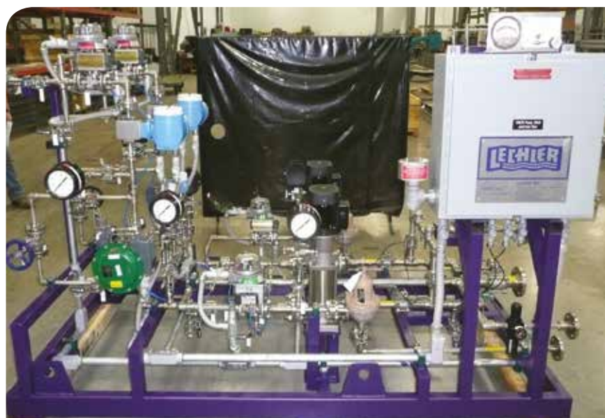
SNCR Ammonia Pump and Control Skid.