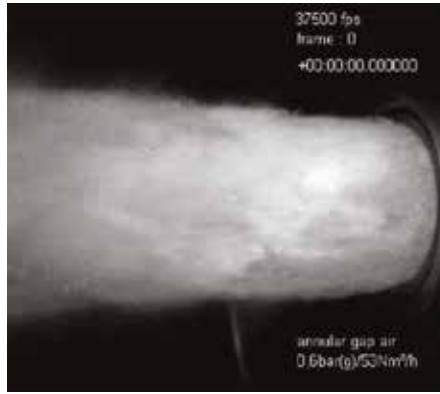
Left: Typical Air Atomizing Nozzle with large droplets exiting the nozzle orifice from the edge. Right: RingGap™ nozzle with Annular Air shearing large droplets from the nozzle edge to create a very tight droplet spectrum.

near the spray injection plane, which can cause massive dust buildup that can fall under gravity and damage downstream components.